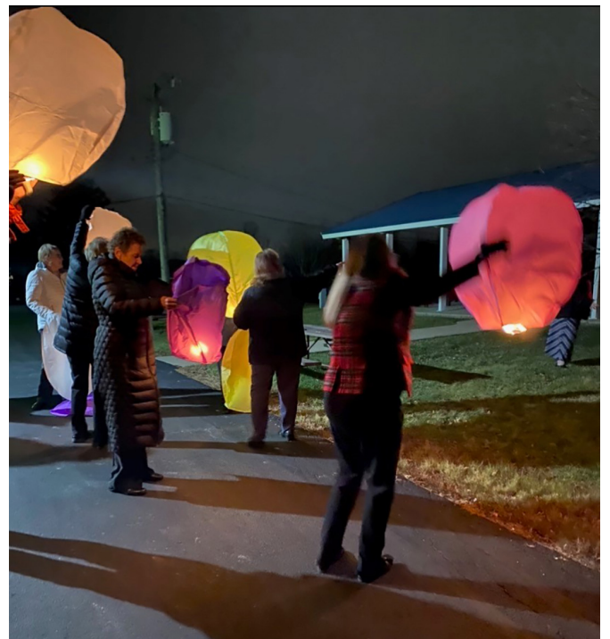
Chinese Lantern launch at the Auxiliary Christmas Party