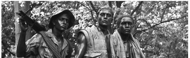
Vietnam War Memorial Statue in Washington D.C.

By putting an end to the war, we prevented the destruction of a beautiful country and allowed it to rebuild and grow for the better. The day teaches us that war is not the answer.