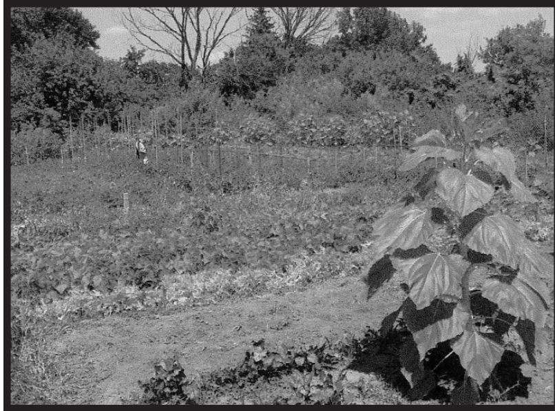
Bob Isenberger Memorial Garden