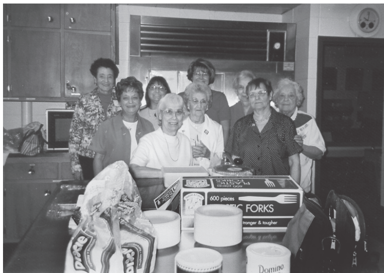
Kitchen Helpers at Legion District Meeting May 17, 2009