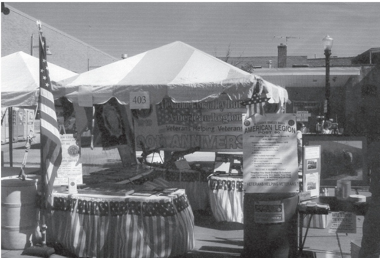
Post 80's Booth Display