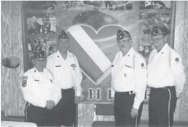
Post 80 Color Guard at the Driveheart Fund Raiser